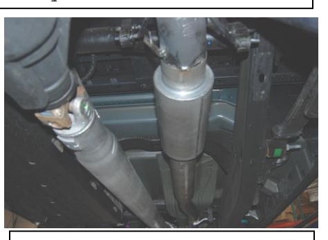
4. Install over axle pipe Item # C into the muffler outlet. Slip the hangers into the rubber grommets and keep tailpipe loose.

6. With proper clearance from spare tire install the exhaust tip onto the tailpipe. The system was designed to have the tip 1" below the quarter panel of the vehicle. With the tip in your desired position begin to tighten down all clamp connections from the