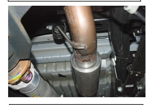
5. With everything loose you may need to adjust the system for proper clearance of shocks, brake lines, ect.

2. Install Head pipe adapter Item # G onto the factory flange. You will re use the factory clamp at this connection. Loosely tighten down the clamp. Install headpipe Item # A onto the adapter. Loosely tighten down.